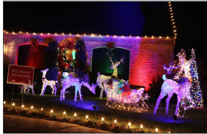
Best Decorations: 11418 Wickersham

Thanks to EVERYONE that decorated with holly & wreaths, lights, inflatables and more! Also a big thanks to the volunteer judges.